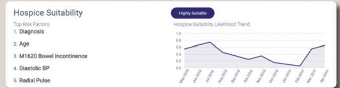
Care setting suitability

Understand when a patient's health is declining and home health may not be the right care setting. WellSky gives you data-driven support to discuss care setting with a patient's physician. For home health agencies that also provide hospice, this feature allows for thoughtful and efficient resource planning when the patient moves to that care setting.